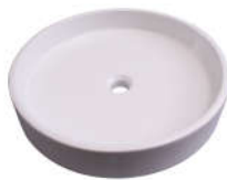
Basin without insert

Diameter: 19-7/8" Above counter height: 3-3/4"